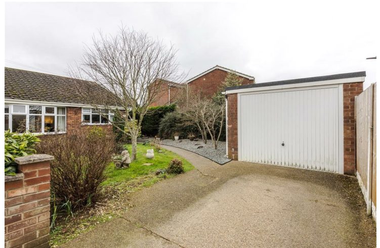
Garage 17'0" x 9'8" (5.19 x 2.95)